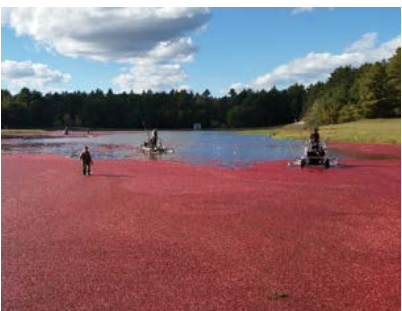
Cranberry harvest in a Massachusetts Cranberry bog