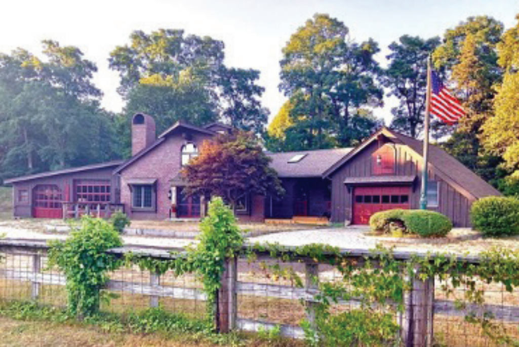
T3C Headquarters at 13 Thomas B. Landers Road

We are grateful to the many supporters whose gifts to the Opportunity Fund allowed us to purchase Millstone Farm.