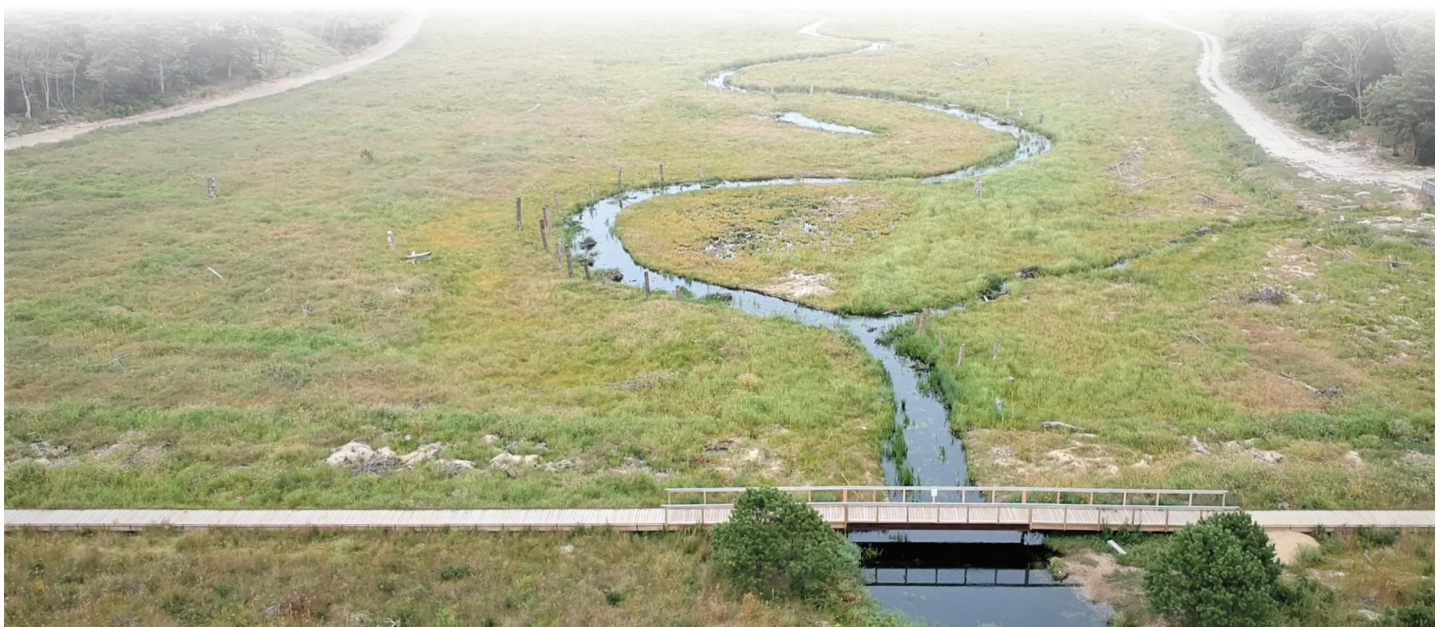
Coonamessett River Greenway

We hope you will join us on our Pathway to Permanence.