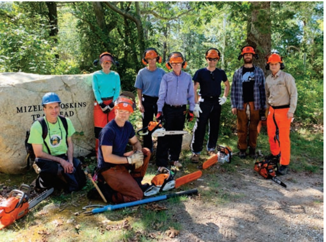
Volunteer land stewards had a fantastic training opportunity with a chainsaw safety workshop held September 28.