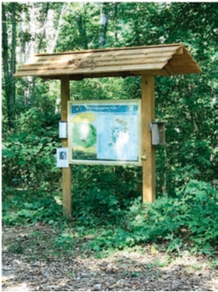
Visitors to Falmouth's conservation lands will see vibrant and informative displays on all our kiosks.