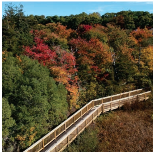
Named in honor of project champion Jeff Williams, the new 405-foot trail at Two Ponds Conservation Area leads to a 360-foot boardwalk, along the edge of Jones Pond and the unique Atlantic White Cedar Swamp. Beyond the boardwalk is the Upper Wetland Loop, a rugged foot path for through-bikers. The total pathway length is now 2,635 feet; 955 feet meet federal trail accessibility guidelines. On November 4, a ribbon-cutting ceremony and the official trail opening were held on site, followed by a celebration at Atria Woodbriar Place.

Executive Director Jessica Whritenour updated the membership on current T3C projects, including the new map, conservation restrictions in the works, public access improvement projects at Two Ponds Conservation Area and the Coonamesett Greenway, and broad efforts in stewardship and outreach. As the meeting drew to a close, T3C leaders extended gratitude to friends, members and volunteers, all of whom are instrumental in making our conservation work possible.