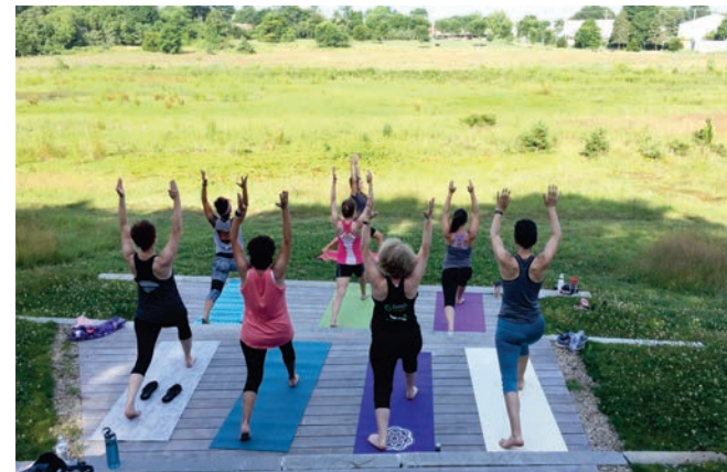
Yoga in the Park was popular this summer and attracted participants every Saturday morning from 8 to 9:00.