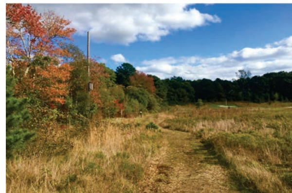
The Park looks beautiful dressed in fall colors!