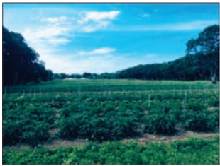
Pariah Dog Farm's 10 acres off Trotting Park Road will be permanently protected for agricultural use with the help of more than $130,000 in federal support to T3C from the USDA's Natural Resources Conservation Services program.

We also thank the Agricultural Conservation Easement Program (ACEP) of the U.S. Department of Agriculture's (USDA's) Natural Resources Conservation Service (NRCS) for major funding that supports the purchase of a conservation restriction on the 10-acre Pariah Dog Farm.