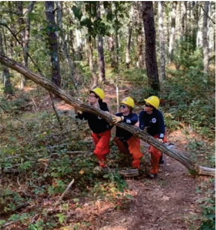
A new group of AmeriCorps members in September worked to clear a portion of the Central Moraine Trail north and south of Brick Kiln Road, in Collins Woodlot and the Falmouth Town Forest.