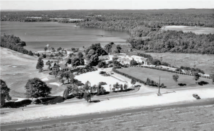
The original Coonamessett Inn overlooking Coonamessett Pond, circa 1950.