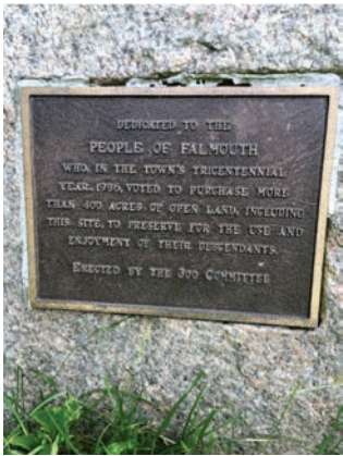
This granite marker and bronze plaque commemorate the Town's landmark purchase of the Coonamessett Reservation in 1986.