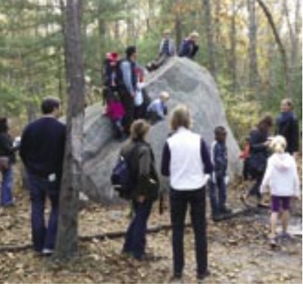
The Beebe Woods family event on November 4 drew more than 100 eager children and parents.