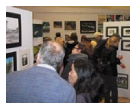
More than 200 friends, family members and others attended the "This Land is Your Land" event.

A multi-media, cross-disciplinary, collaborative project between faculty and students at Falmouth High School and The 300 Committee culminated February 9 at FHS with an enormously successful event that celebrated open space in Falmouth through artwork and oral histories. This project was generously funded by a grant from the Falmouth