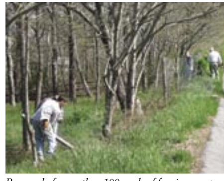
Removal of more than 100 yards of fencing was part of the major spring cleaning effort at River Bend.