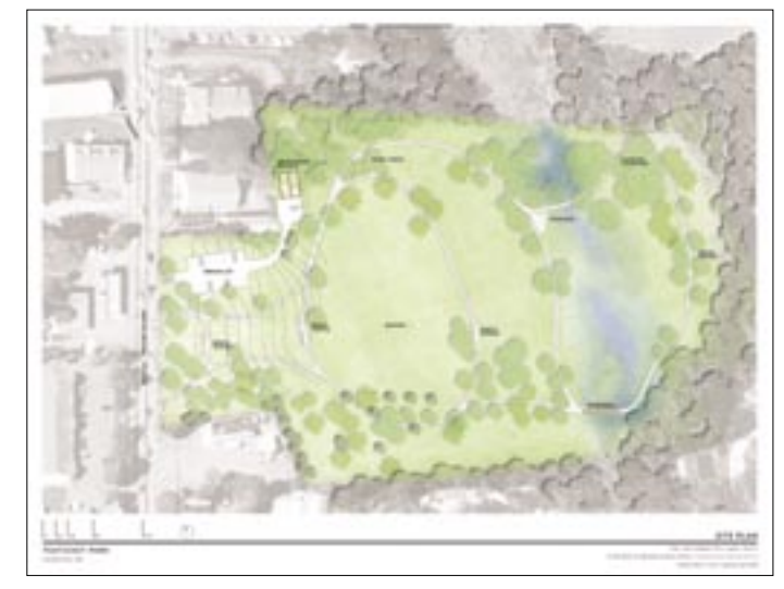
The design for Teaticket Park was approved in April by The 300 Committee Board of Directors. A major change was the relocation of the parking area.

permitting process for the upcoming demolition and finalizing the conservation restriction for the property with the Town and the State.