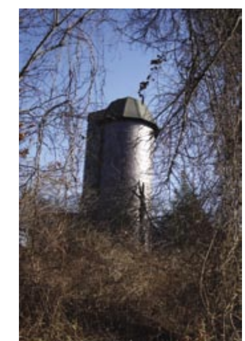
Looking up from the Coonamessett River through the brambles, The River Bend silo remains in place after the removal of other buildings on the property.