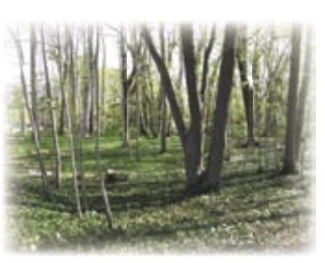
The Garland Parcel on busy Palmer Avenue Story on page 5.

We are grateful to the Falmouth Enterprise for its support in publishing this newletter