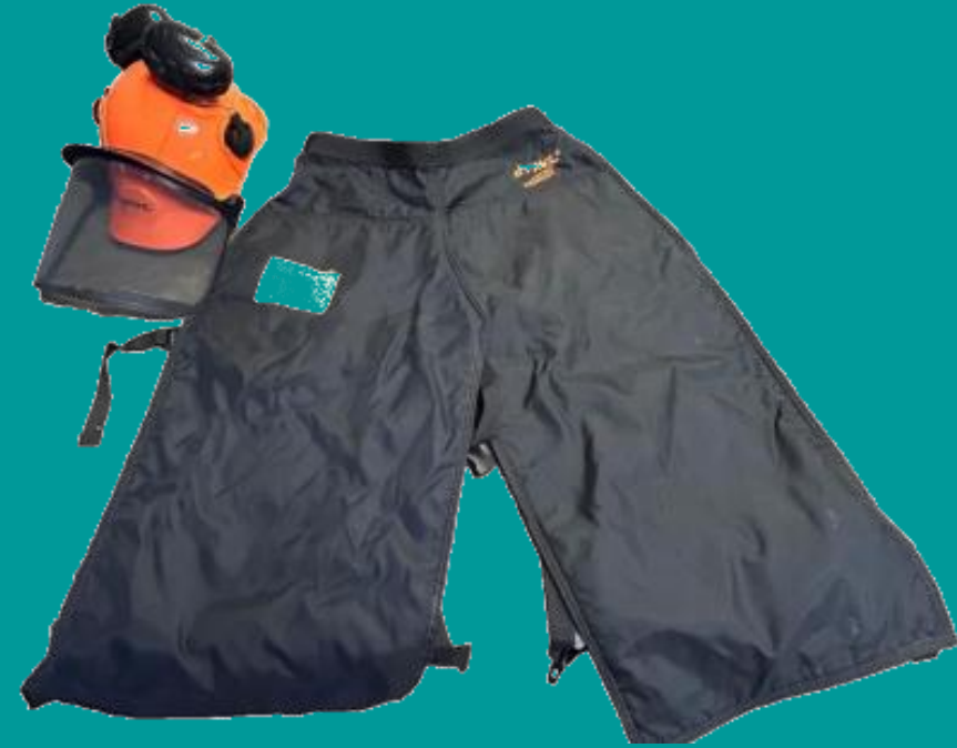
Chaps and Helmet