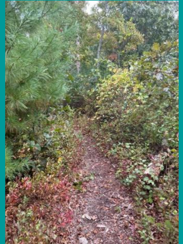
Dense vegetation growing onto trail