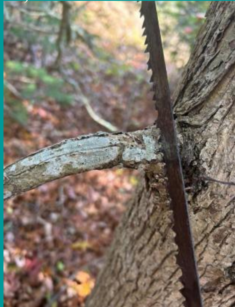
Cut right below the collar