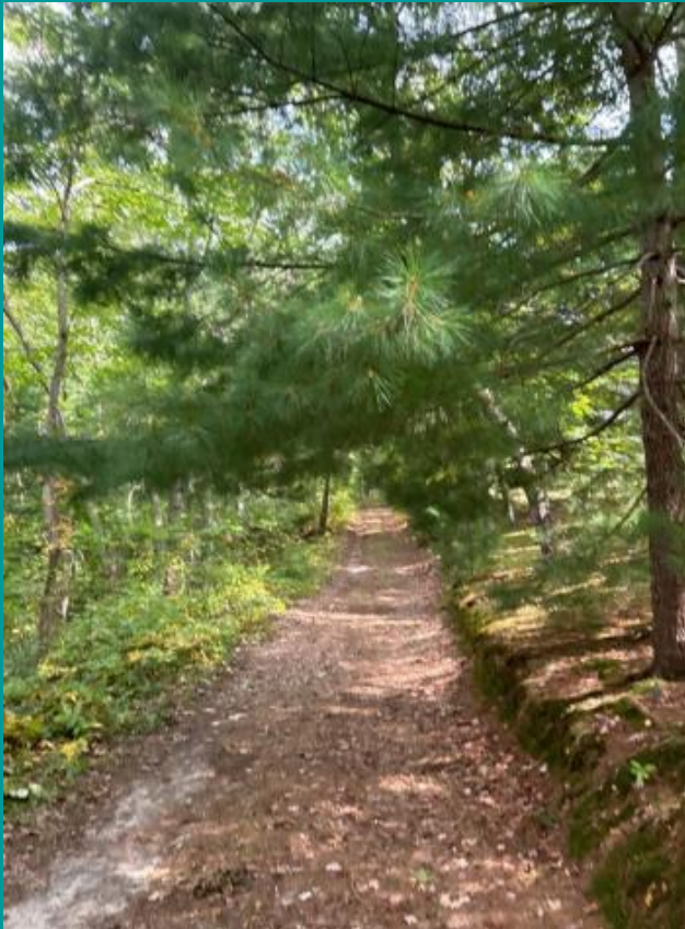
Low Hanging Branches