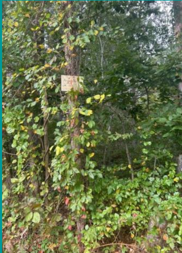
Vegetation Obstructing Signs