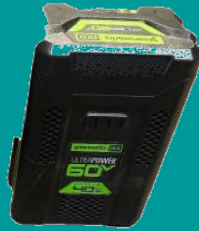
Batteries (82 and 60 Volt)